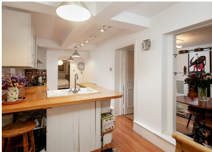
Vaults, Courtyard Apartment, 23 Caledonia Place, Clifton, Bristol BS8 4DL

Approx. Gross Internal Area 624 Sq Ft - 58 Sq M