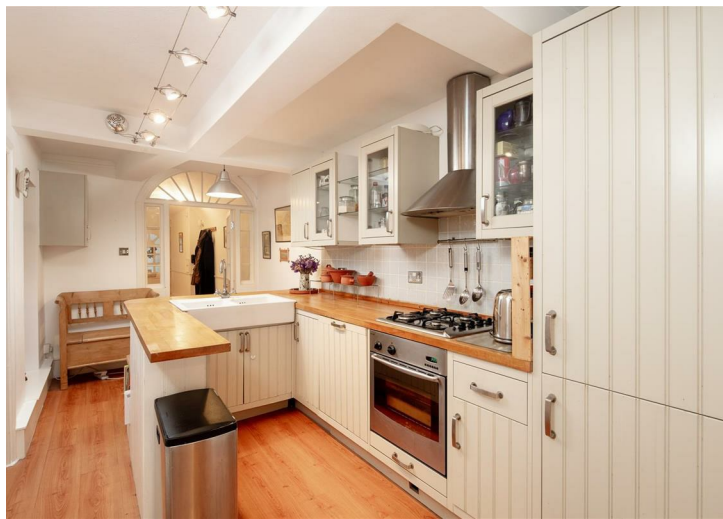
Courtyard Apartment, 23 Caledonia Place, Clifton, Bristol BS8 4DL

Approx. Gross Internal Area 968 Sq Ft - 90 Sq M